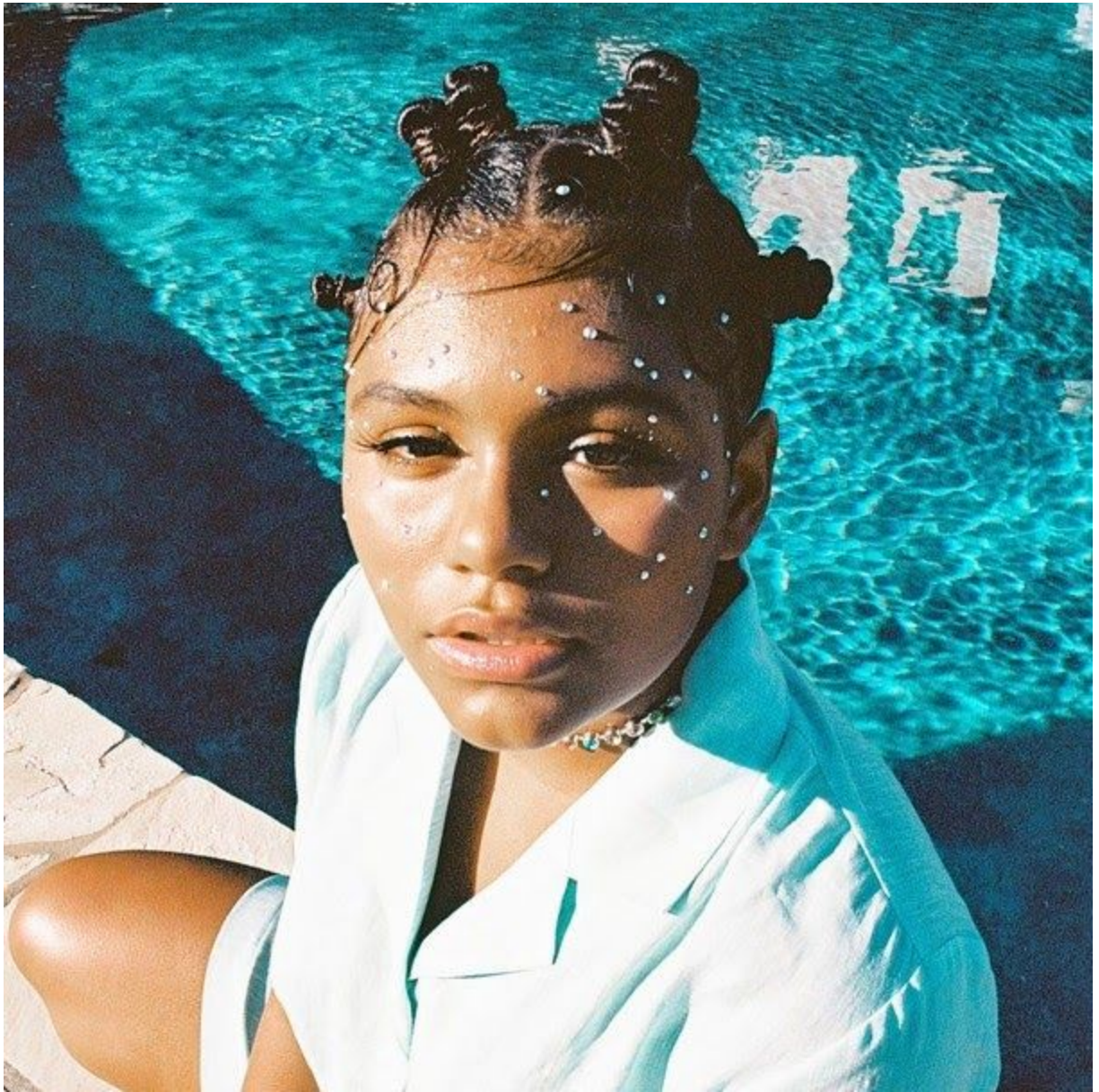
Vestido Luna