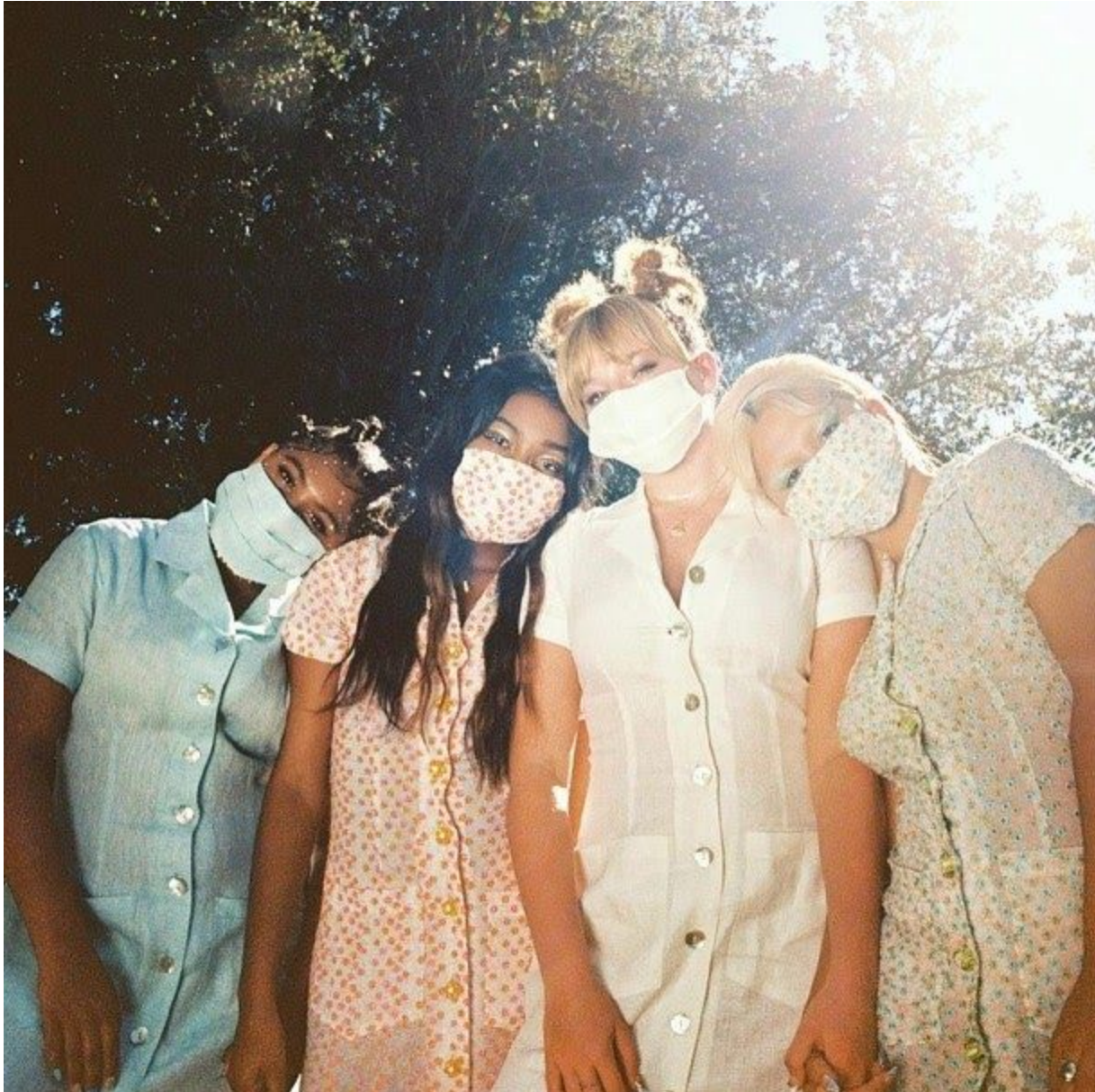
Vestido Luna